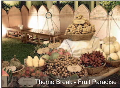
Theme Break - Fruit Paradise

“ YOUR PERFECT MEETING VENUE IN THE EAST OF THAILAND, JUST 2.5 HOUR DRIVE FROM BANGKOK ”