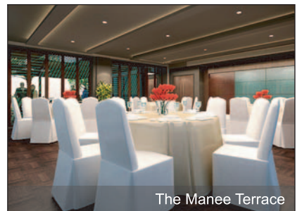
The Manee Terrace