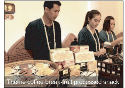
Theme coffee break-fruit processed snack