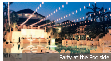
Party at the Poolside