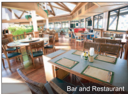
Bar and Restaurant

In addition , given abundance of our garden area, we have been hosting many team building activity and also taking part in CSR activity that guests wish to set up in Chanthaburi.