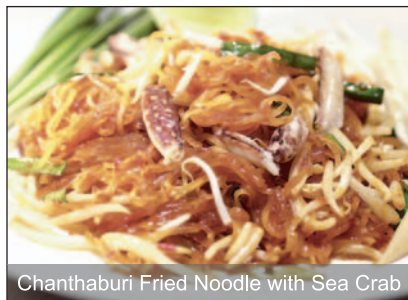
Chanthaburi Fried Noodle with Sea Crab