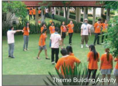
Theme Building Activity